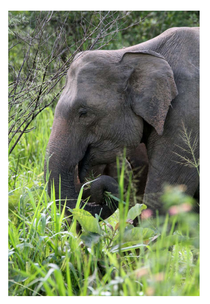
Elephant, Yala National Park, Sri Lanka.