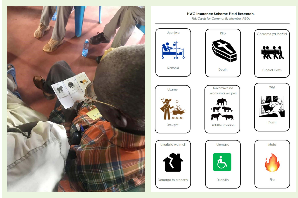
Risk cards used during data collection in Kenya

In Kenya, AB Consultants collected the data in Kajiado and Taita-Taveta County through focus groups, to gain an understanding of household risk profiles and prioritisation, perceptions of HWC, costs and current coping mechanisms, and views on a proposed insurance scheme. AB Consultants also used questionnaires to collect demographic and financial data to understand income levels and saving patterns to inform both willingness and ability to pay for premiums. It designed risk cards to assist respondents who were not literate or numerate and employed research assistants from the communities to help with buy-in.<sup>15</sup>