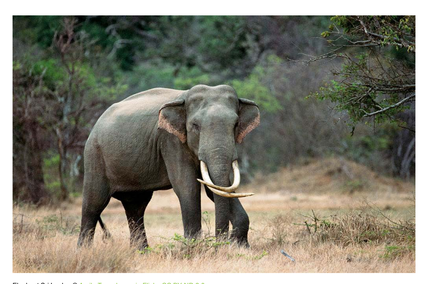
Elephant Sri Lanka.