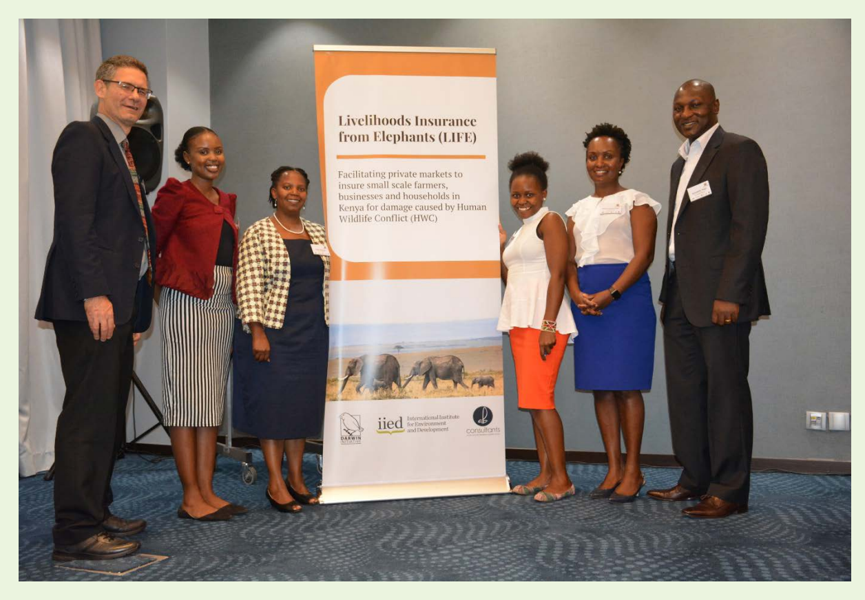
Members of the LIFE project at the national consultative forum in Kenya